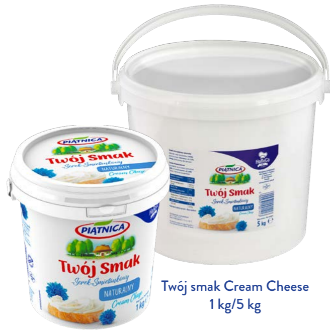
Twój smak Cream Cheese 1 kg/5 kg