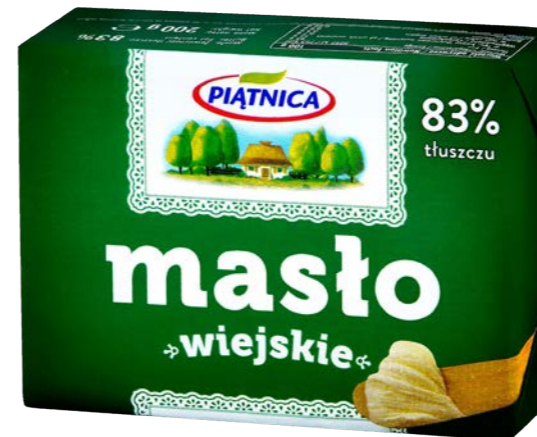
Premium Butter Extra

Premium Butter Extra is a traditional, natural butter produced exclusively from one ingredient – high quality pasteurized cream. The Butter Spread from Ostrołęka perfectly balances milk fat and high-quality vegetable oils to preserve rich butter flavor and ensure easy bread spreading.