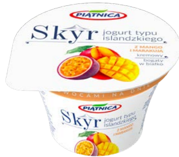
Skyr with mango and passion fruit