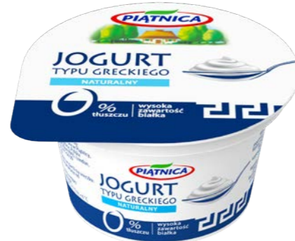
Greek Type Yoghurt natural 0%