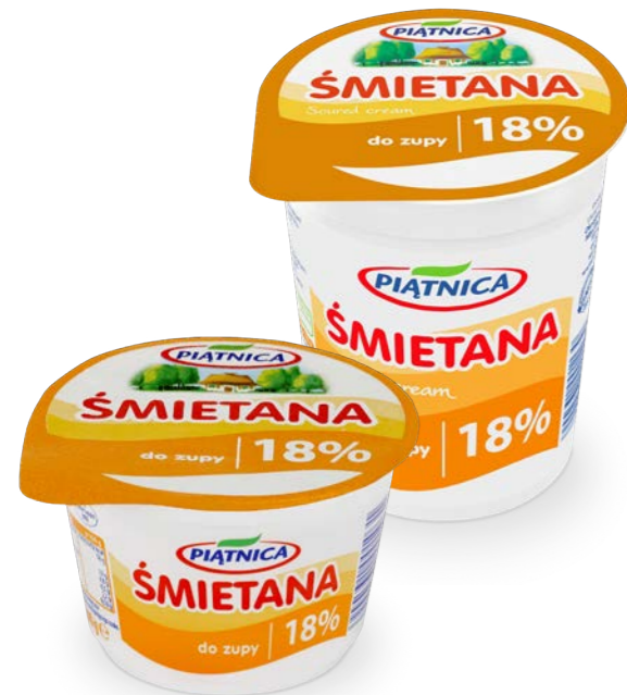
Soured cream 18% 200 g / 400 g

OSM Piątnica is the largest producer of soured cream in Poland. Consumers appreciate its high quality, taste and wide versatility in the kitchen. Pasteurized soured cream has clear markings indicating its fat content and uses.