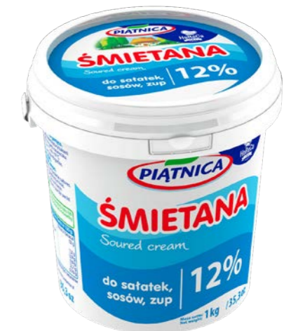
Soured Cream 12% 1 kg