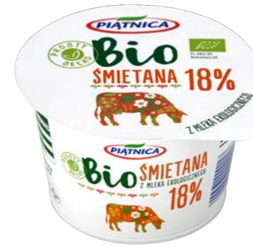
Organic Soured Cream 18%

Products made from milk supplied by farmers operating certified, organic farms.