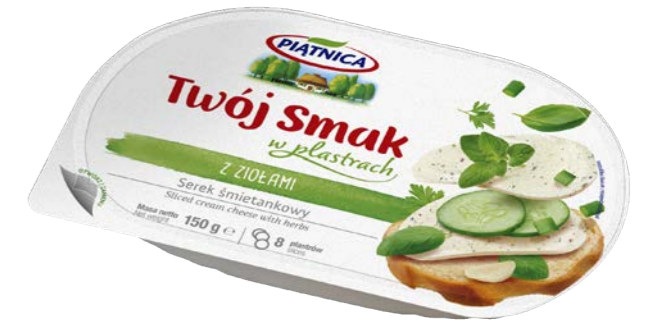
Twój Smak Sliced Cheese with herbs