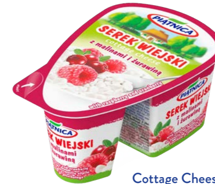
Cottage Cheese with raspberries & cranberries