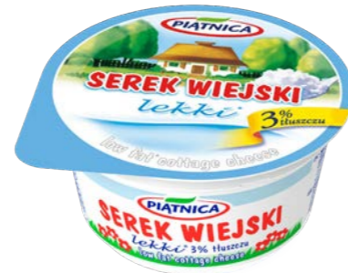
Cottage Cheese Light 150 g