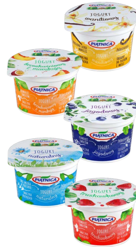
Yoghurts 100 g