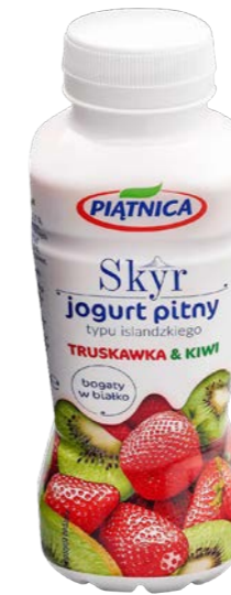
Drinkable Yoghurt Skyr with strawberries and kiwi