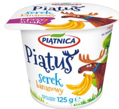
Piątuś Fromage Frais with banana