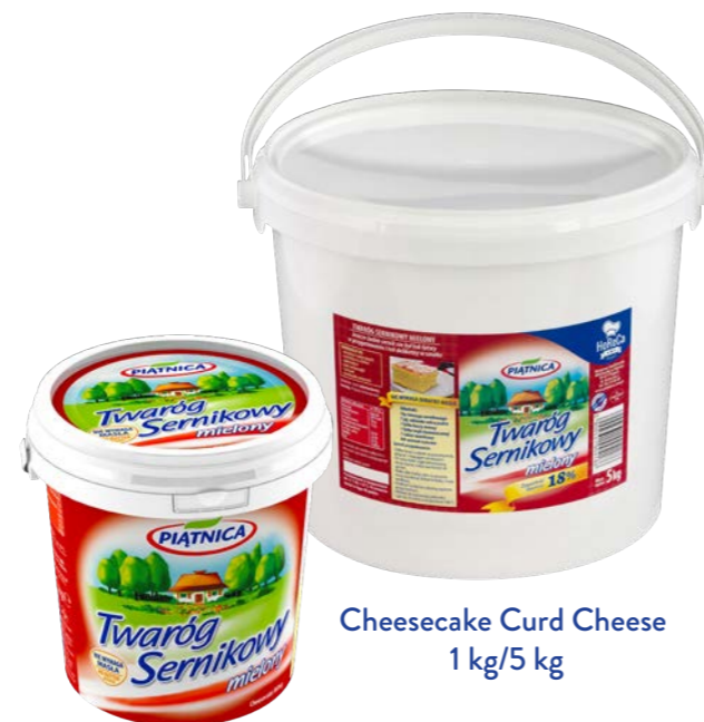
Cheesecake Curd Cheese 1 kg/5 kg