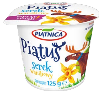
Piątuś Fromage Frais with vanilla