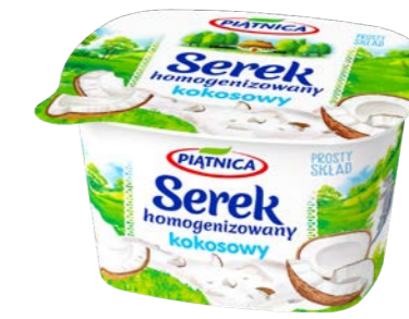
Coconut Fromage Frais