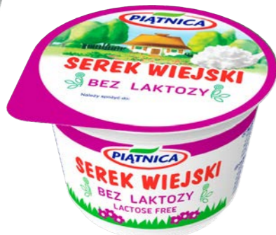
Lactose free Cottage Cheese 200 g