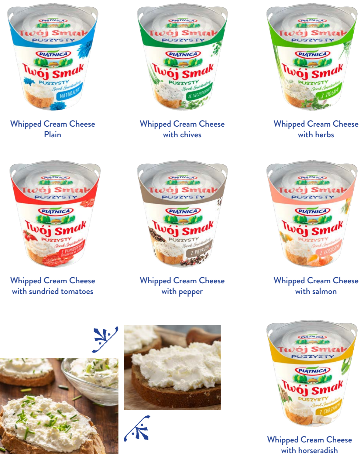
Whipped Cream Cheese Plain

Extra whipped with an exceptionally delicate taste, this cream cheese is produced from natural ingredients, offering a fluffy texture and a wide range of flavors. It's an ultimate choice for health-conscious food lovers.