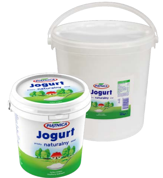
Natural Yoghurt 1 kg/10 kg