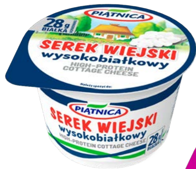
High protein Cottage Cheese 200 g