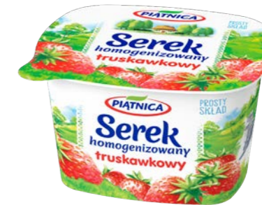
Strawberries Fromage Frais