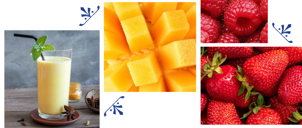
Whey protein drinks strawberry and banana