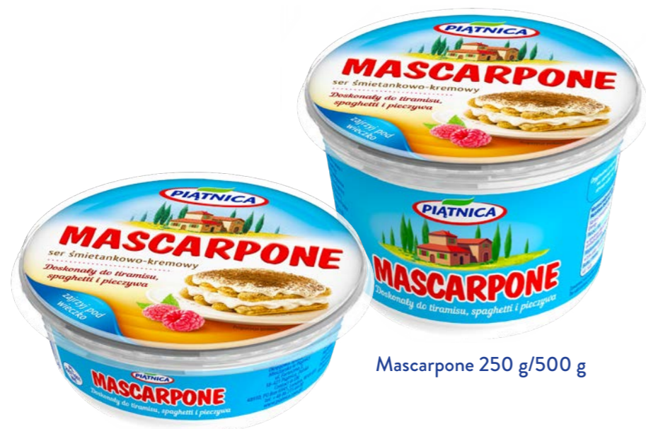
Mascarpone 250 g/500 g

A fresh and soft type of cheese originating from southern Europe. Carefully produced using traditional methods from pure cream, it offers a velvety texture, natural creamy taste, and a high fat content.