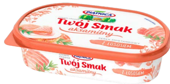
Twój Smak Aksamitny Cream Cheese with salmon