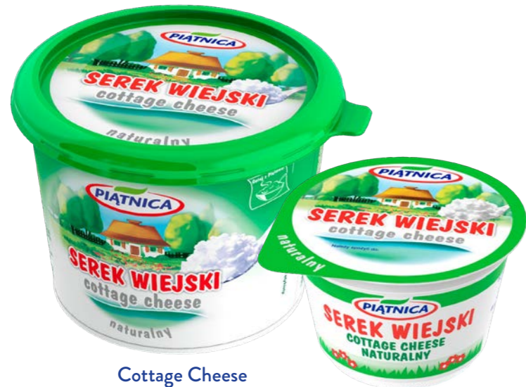
Cottage Cheese 200 g/500 g