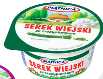
Cottage Cheese with chives 150 g