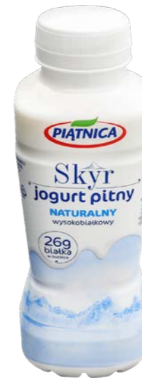
Drinkable Yoghurt Skyr plain