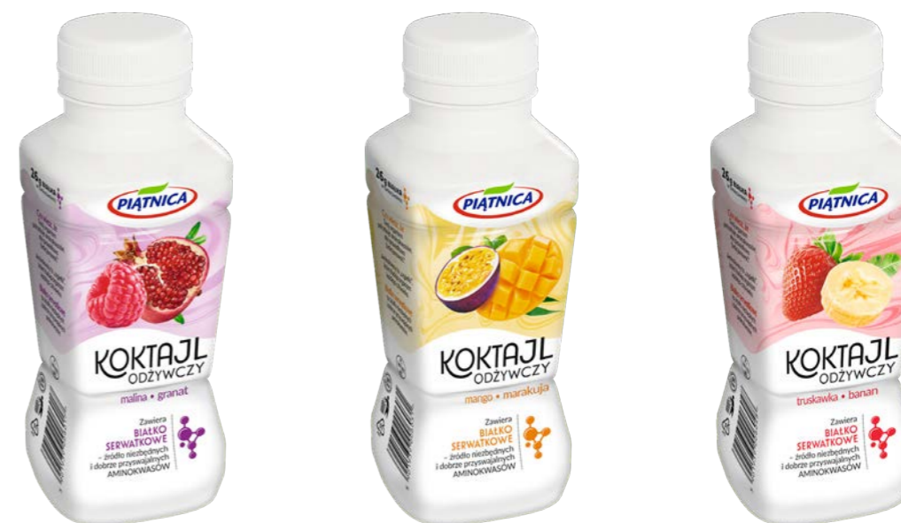
Whey protein drinks raspberry and pomegranate

These are unique, 100% natural drinks with whey protein, providing an essential and easily digestible source of amino acids. Available in delicious flavour compositions.