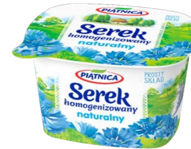
Natural Fromage Frais