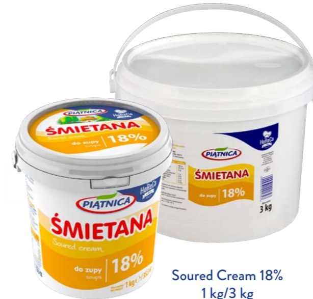
Soured Cream 18% 1 kg/3 kg