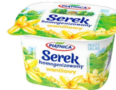
Vanilla Fromage Frais

A delicious, creamy fromage frais is an ideal proposition for every traditional dairy products' gourmets. Timeless taste that we remember from childhood and a simple composition are the main advantages of this cheese.