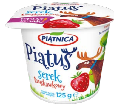
Piątuś Fromage Frais with strawberries