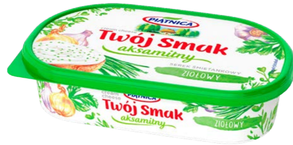
Twój Smak Aksamitny Cream Cheese with herbs