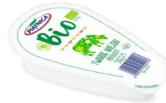
Organic Curd Cheese