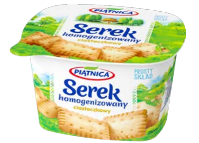
Cookie Fromage Frais