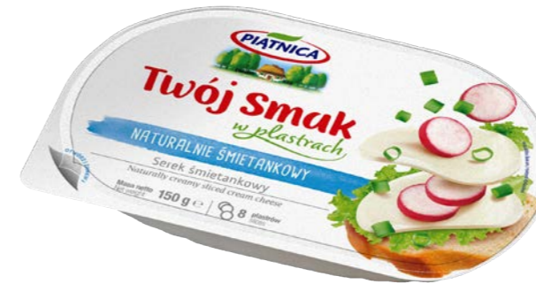
Twój Smak Sliced Cheese naturally creamy

Each slice of Twój Smak cheese is filled with the velvety taste of mascarpone – naturally delicious and free from artificial additives. The unique slice shape makes Twój Smak Sliced Cheese an ideal choice for delectable starters, flavorful sandwiches, and delicious toasts.