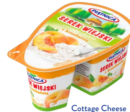
Cottage Cheese with peach