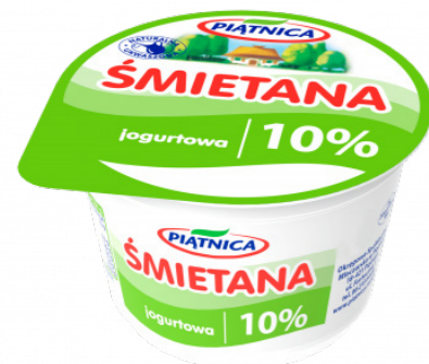
Soured cream 10% 200 g