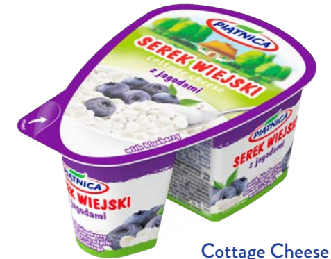
Cottage Cheese with blueberries