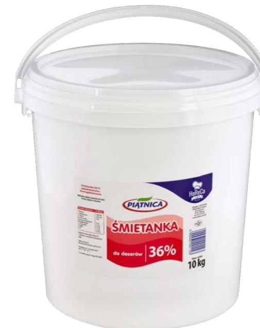
Cream 36% 10 kg