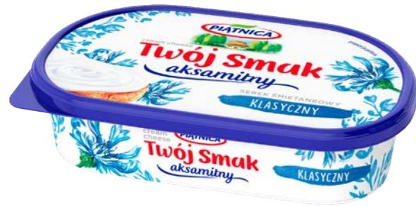
Twój Smak Aksamitny Cream Cheese classic

Twój Smak Aksamitny Cream Cheese is a versatile delight, offering countless culinary possibilities. While it tastes best on fresh, crunchy bread, it's equally delightful when served with toast or crackers.