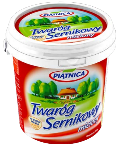
Cheesecake Curd Cheese