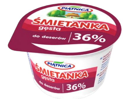
Cream 36% 200 g