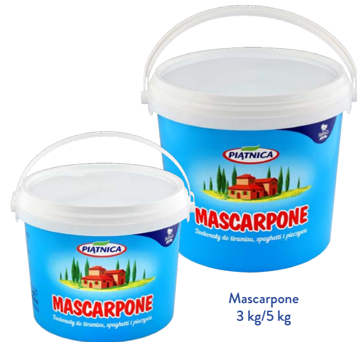
Mascarpone 3 kg/5 kg