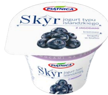
Skyr with blueberries