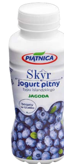
Drinkable Yoghurt Skyr with blueberries