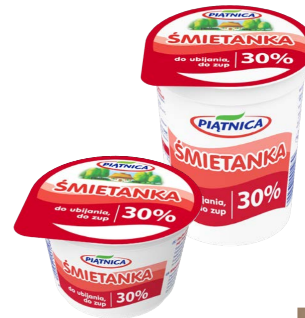
Cream 30% 200 g / 400 g

Cream is a versatile product, essential in every kitchen. The original preparation process and semi-liquid consistency enables it to be whipped extremely quickly, creating a fluffy base for layering and filling cakes and pastries as well as decorating other dishes.