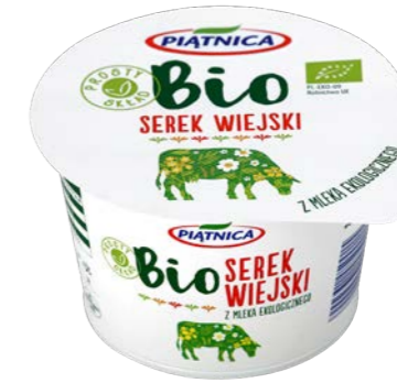
Organic Cottage Cheese