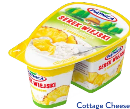
Cottage Cheese with pineapple