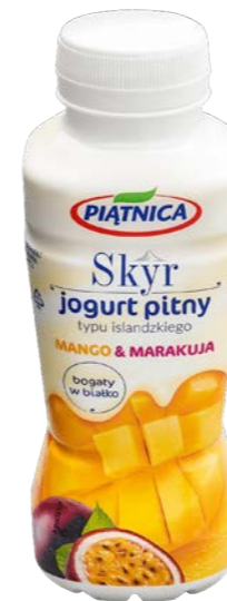
Drinkable Yoghurt Skyr with mango and passion fruit

Delicious drinkable skyr with a high content of nutritious protein. A perfect choice for active people, providing them strength and energy needed to fuel their day with vitality.