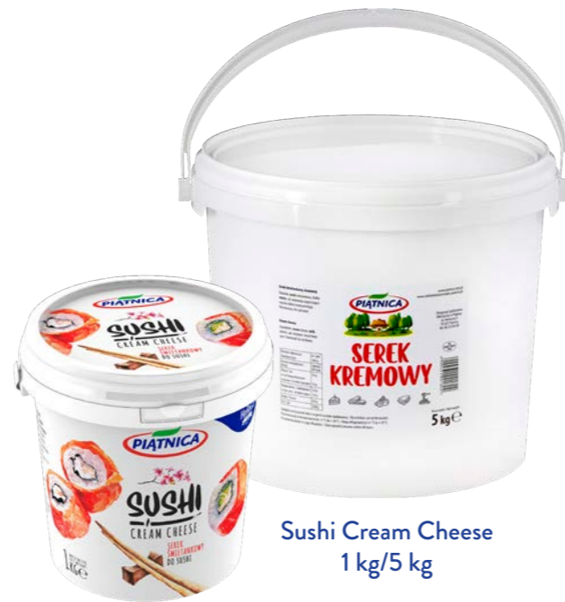
Sushi Cream Cheese 1 kg/5 kg