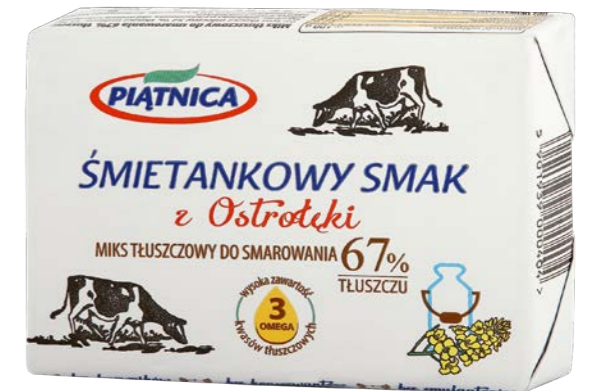
Butter Spread from Ostrołęka