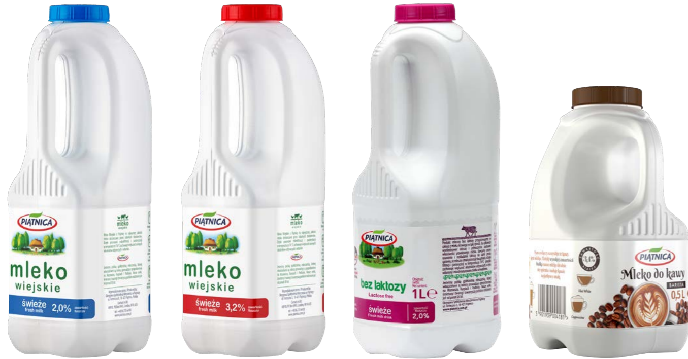
Fresh Milk 2,0%

Milk from Piątnica in a convenient bottle with a handle is the highest quality milk with traditional taste. Thanks to cooperation with local farmers supplying milk of the highest quality standards in Poland and a unique process of production, milk retains valuable vitamins, nutritional values and natural flavour.