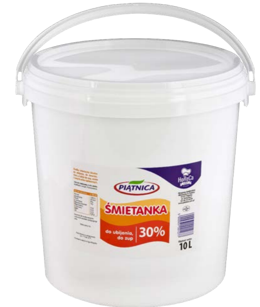
Cream 30% 10 l