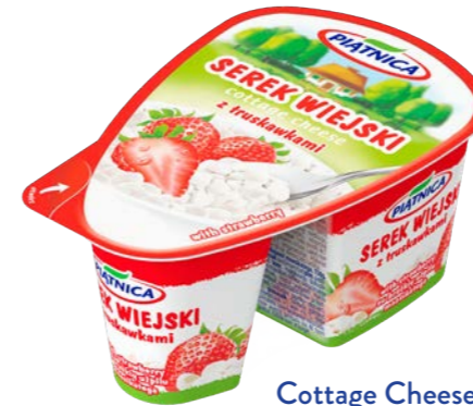
Cottage Cheese with strawberries