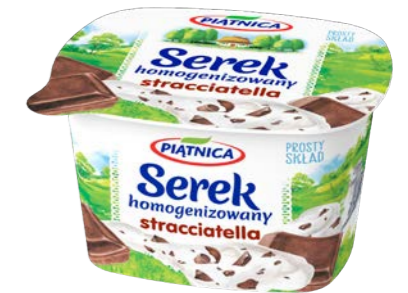
Stracciatella Fromage Frais