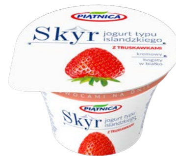
Skyr with strawberries