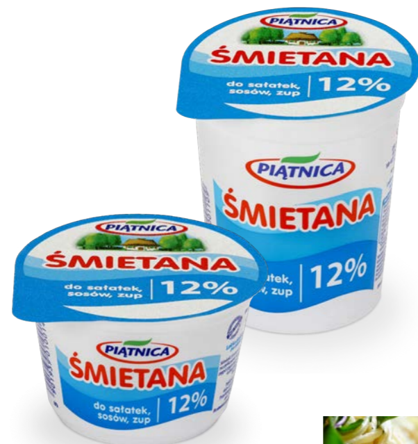
Soured cream 12% 200 g / 400 g