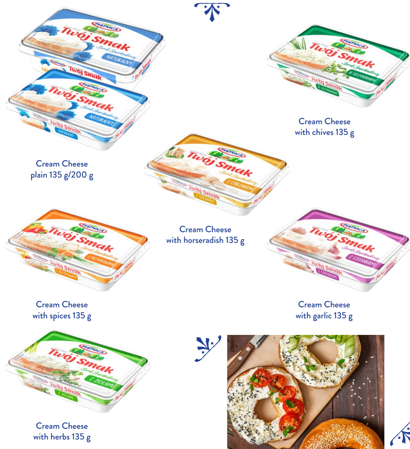
Cream Cheese plain 135 g/200 g

This cream cheese is not just for sandwiches; it's a versatile ingredient that elevates a wide range of dishes, from dips and sauces to fillings. Made from top-quality ingredients, Twój Smak cheese is available in a variety of flavors, catering to diverse customer preferences.