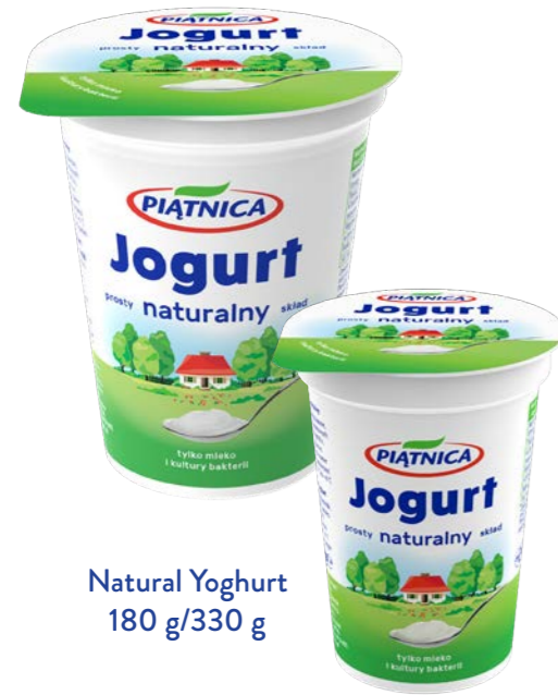
Natural Yoghurt 180 g/330 g

Velvety, packed with valuable proteins, vitamins and minerals. Genuine yoghurt – contains milk and live bacterial cultures only. Enjoy it plain, straight from the cup, or mixed with cereals, bran and fruit. An irreplaceable ingredient in desserts, salads and sauces.