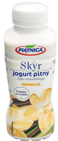
Drinkable Yoghurt Skyr with vanilla