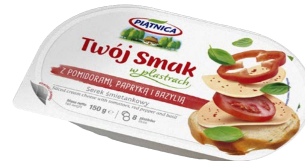
Twój Smak Sliced Cheese with tomato, pepper and basil