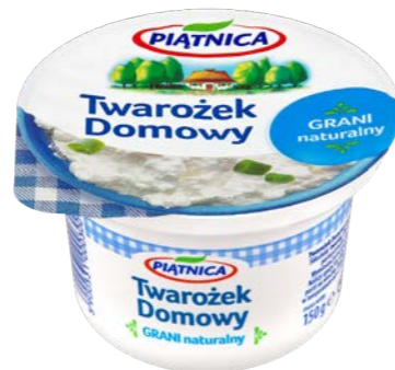
Natural homemade Cottage Cheese