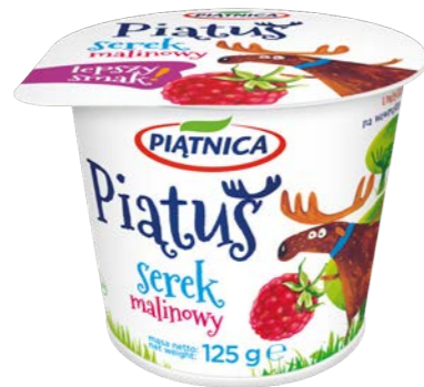
Piątuś Fromage Frais with raspberries